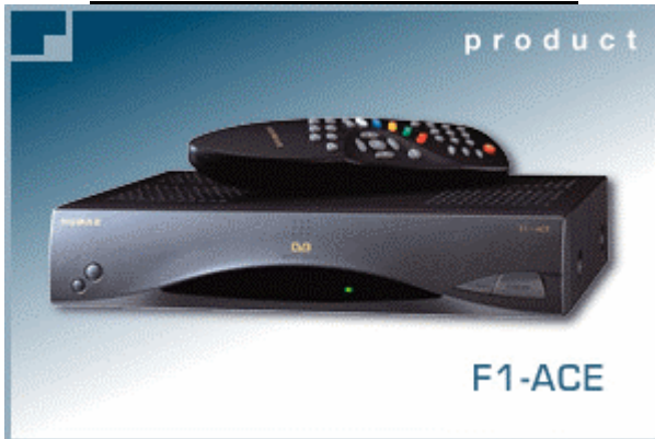
Humax F1-Ace FTA Satellite Receiver: